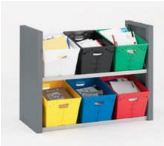
6 tote table-top sorter