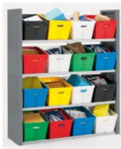
16 Tote Sorter