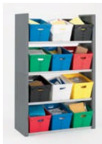
12 Tote Sorter