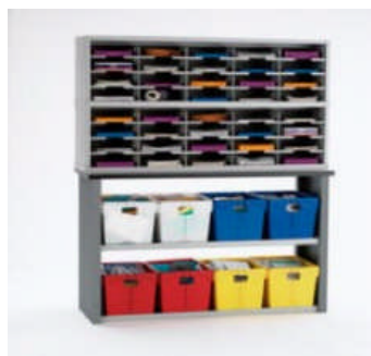
8 tote & 40 pocket sorter