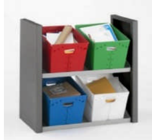
2 tote table-top sorter